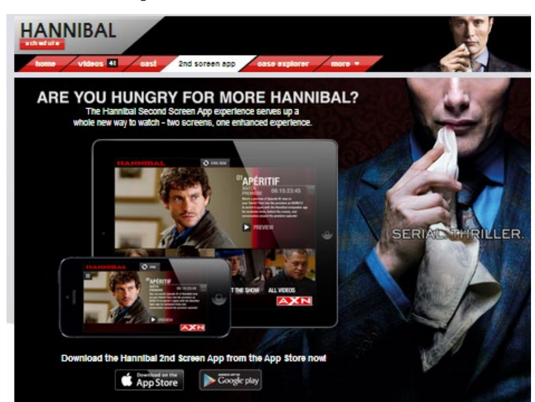
Figure 2 – Hannibal' second screen web site

The application was put available for free for the majority of OS. The Hannibal project was the first one to bring to Brazil a SS app related to a television serie. Taking advantage of internet-connected devices and the transmedia storytelling perspective, the horror serie is an example on how users can benefit from IoT development and enhance their experience with their electronic devices in an expressive domestication process.